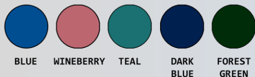
BLUE WINEBERRY TEAL DARK BLUE FOREST GREEN